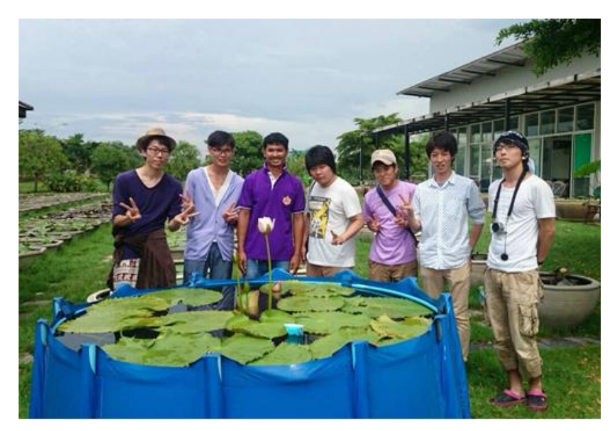
A field survey was held at Lotus Museum at RMUTT.