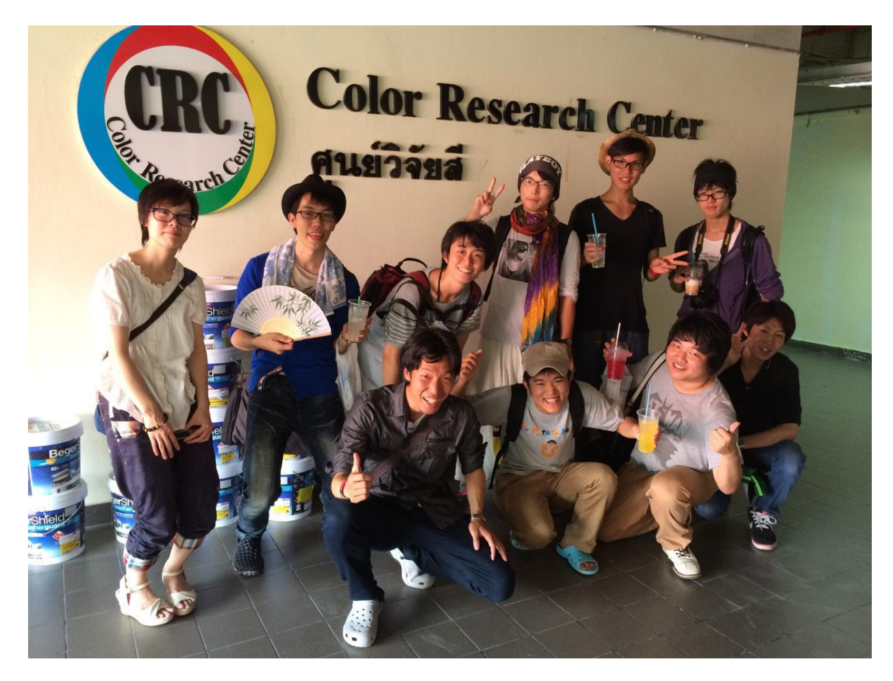
Students Meijo University from conducted scientific experiments at Color Research Center at RMUTT.